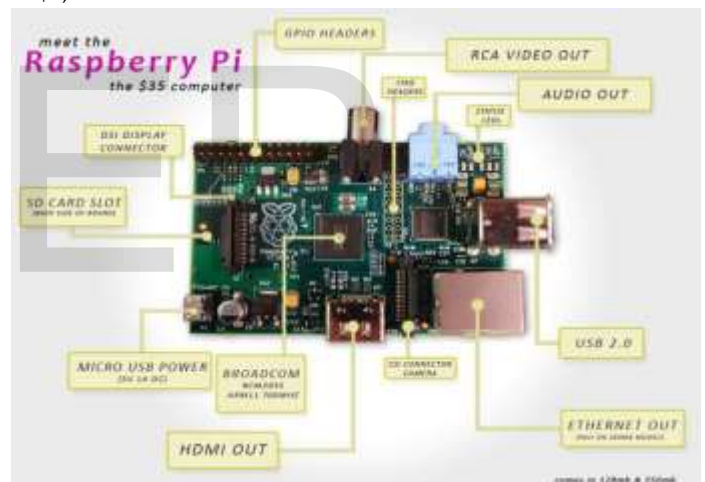
Fig. 1 Raspberry Pi

mean double precision performance of 0.041 GFLOPS for one Raspberry Pi Model-B board. A cluster of 64 Raspberry Pi Model-B computers, labelled "Iridis-pi", achieved a LINPACK HPL suite result of 1.14 GFLOPS (n=10240) at 216 watts for c. US$4,000.